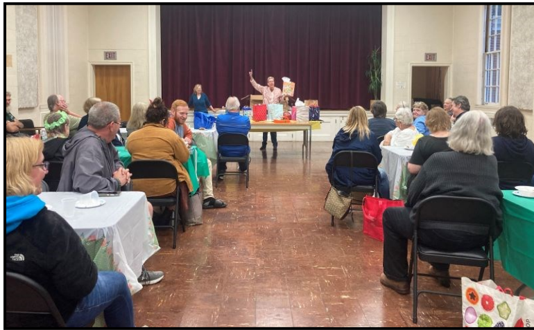
Penny from page 3

generosity of all who attended netted $426 for the general fund of the church!